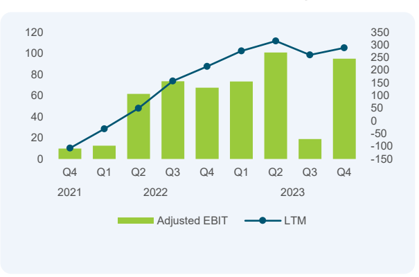
Adj. EBIT, quarterly and 12 months rolling, SEK million

66.1 percent (74.6) of net sales originated in Americas, 25.4 percent (20.2) in EMEA and 8.5 percent (5.2) in Asia Pacific.